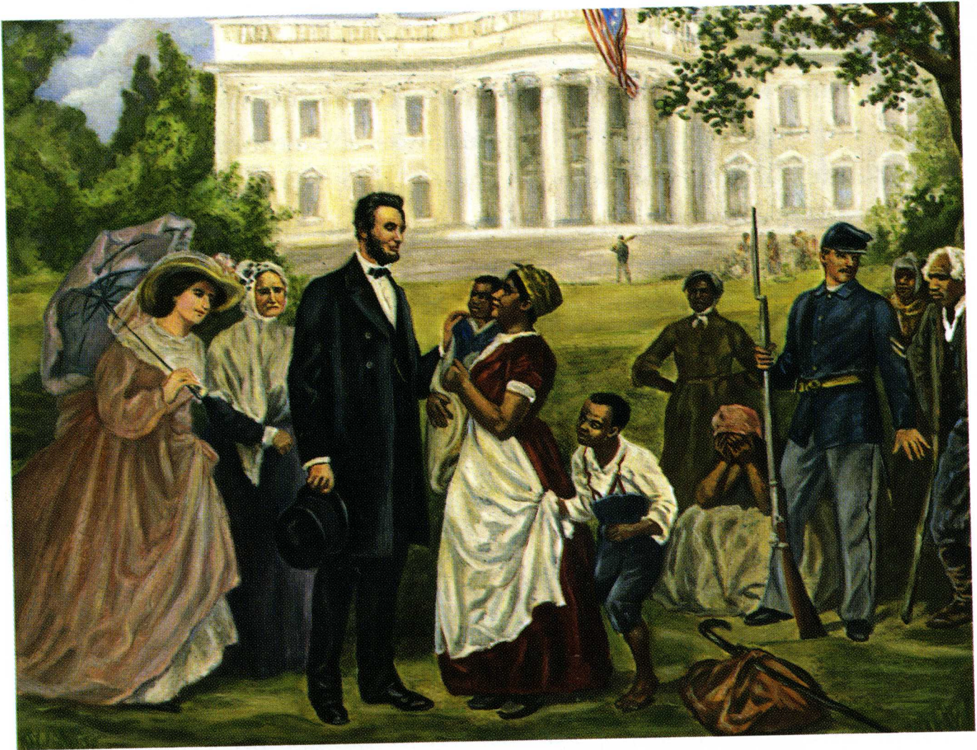
Abraham Lincoln greeting African Americans by an unknown artist.

National Cemetery at the place of the battle. He gave a famous speech, called 'The Gettysburg Address', expressing the principles of democratic government. In his speech Lincoln used, for the first time, the famous expression 'government of the people, by the people, for the people.'