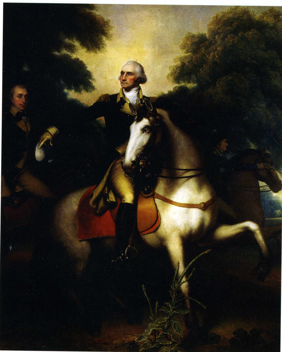
George Washington (1824) by Rembrandt Peale